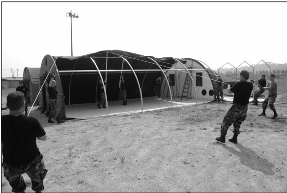
Below: Kentucky Air Guard medical troops pull a canvas roof over an EMEDS facility that's being inspected for operational readiness.