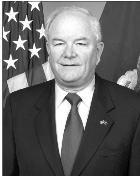
Michael W. Wynne Secretary of the Air Force

This continues to be a daunting task as we are pushed and pulled toward a future we cannot always control. We are not shirking from our goals. It is the duty of