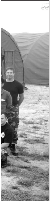
/ Pacific Air rea.